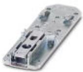
Universal DIN rail adapter

Assembly adapters - UTA 107/30 - 2320089