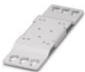
Universal wall adapter for securely mounting the power supply in the event of strong vibrations. The power supply is screwed directly onto the mounting surface. The universal wall adapter is attached at the top/bottom.

Assembly adapters - UWA 182/52 - 2938235