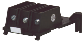
Start Contacts for Manual Overload Relays only and used in Series 3000 Starters