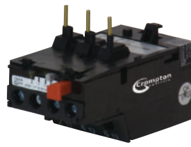
Manual Overload Reset Used in Series 3000 Starters