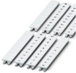
Zack marker strip, 10-section, horizontally labeled with the consecutive numbers: 31 ... 40, white, width: 5 mm

Please be informed that the data shown in this PDF Document is generated from our Online Catalog. Please find the complete data in the user's documentation. Our General Terms of Use for Downloads are valid ( http://phoenixcontact.com/download )