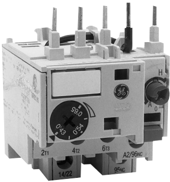
Mini Contactor Overload Relay

GEH-5932 MT03 Thermal-Overload Relay Global Instructions