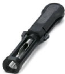
Contact removal tool, for turned CK 2,5... contacts

Please be informed that the data shown in this PDF Document is generated from our Online Catalog. Please find the complete data in the user's documentation. Our General Terms of Use for Downloads are valid ( http://phoenixcontact.com/download )