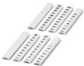
Zack marker strip flat, 10-section, horizontally labeled with the consecutive numbers: 31 ... 40, white

Please be informed that the data shown in this PDF Document is generated from our Online Catalog. Please find the complete data in the user's documentation. Our General Terms of Use for Downloads are valid ( http://phoenixcontact.com/download )