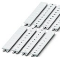
Zack marker strip, 10-section, horizontally labeled with the consecutive numbers: 1 ... 10, white

Please be informed that the data shown in this PDF Document is generated from our Online Catalog. Please find the complete data in the user's documentation. Our General Terms of Use for Downloads are valid ( http://phoenixcontact.com/download )