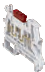
0371 80 + automotive-type fuse