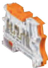
0371 84 + 0371 86