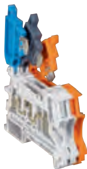
0371 82 + 0371 83 + 0371 85