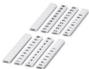
Zack marker strip flat, 10-section, horizontally labeled with the consecutive numbers: 21 ... 30, white

Please be informed that the data shown in this PDF Document is generated from our Online Catalog. Please find the complete data in the user's documentation. Our General Terms of Use for Downloads are valid ( http://phoenixcontact.com/download )