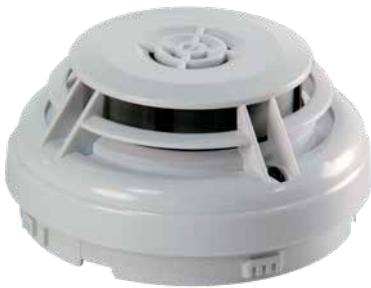
High Sensitivity Smoke Sensor