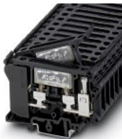
Fuse terminal block for cartridge fuse insert, cross section: 0.5 - 16 mm 2 , AWG: 26 - 8, width: 10.2 mm, color: black

Please be informed that the data shown in this PDF Document is generated from our Online Catalog. Please find the complete data in the user's documentation. Our General Terms of Use for Downloads are valid ( http://phoenixcontact.com/download )