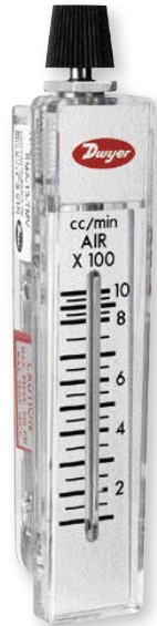
Model RMA-TMV 2" scale, 4-13/16" high