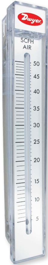
Model RMC 10" scale, 15-3/8" high

2", 5" or 10" Scale, Interchangeable Bodies