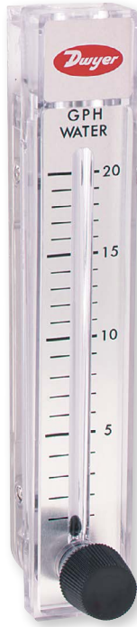
Model RMB-SSV 5" scale, 8-3/4" high