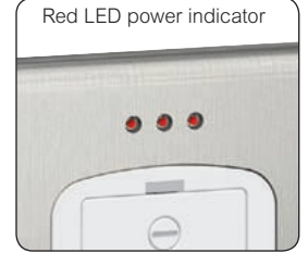
Red LED power indicator

Brushed stainless steel front plates : brushed stainless steel with clear epoxy satin lacquer coating Polished stainless steel front plates : electroplated stainless steel plate with trivalent chrome for mirror finish White interiors and rockers Terminal screws captive and backed off ready for cabling