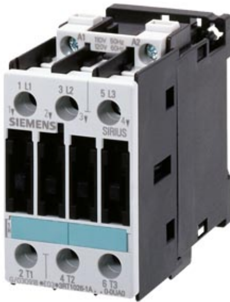
CONTACTOR, AC-3 11 KW/400 V, AC 110 V, 50 HZ, 3-POLE, SIZE S0, SCREW CONNECTION