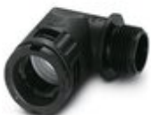
Cable gland, metric thread, IP68/69k protection, angled

Screw connection - WP-GA HF IP69K M20 BK - 3240912