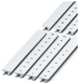
Zack marker strip, 10-section, horizontally labeled with the consecutive numbers: 61 ... 70, white

Please be informed that the data shown in this PDF Document is generated from our Online Catalog. Please find the complete data in the user's documentation. Our General Terms of Use for Downloads are valid ( http://phoenixcontact.com/download )