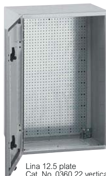
Lina 12.5 plate Cat. No. 0360 22 vertical mounting inside Atlantic enclosure Cat. No. 0369 26