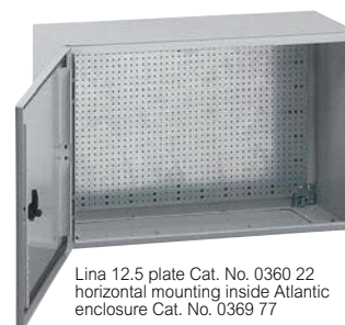
Lina 12.5 plate Cat. No. 0360 22 horizontal mounting inside Atlantic enclosure Cat. No. 0369 77

Enclosure and equipment selection chart p. 8-9 Technical characteristics p. 17