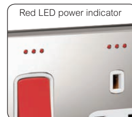
Red LED power indicator

Brushed stainless steel front plates : brushed stainless steel with clear epoxy satin lacquer coating Polished stainless steel front plates : electroplated stainless steel plate with trivalent chrome for mirror finish White interiors and rockers (red rockers for specific items) Terminal screws captive and backed off ready for cabling