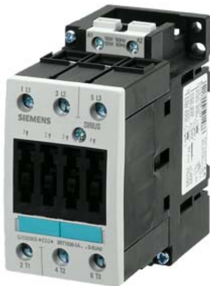
CONTACTOR, AC-3 18.5 KW/400 V, AC 24V 50/60HZ, 3-POLE, SIZE S2, SCREW CONNECTION