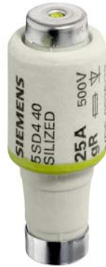
SILIZED fuse link 500 V for semiconductor protection Quick-acting, Size DII, E27, 25A