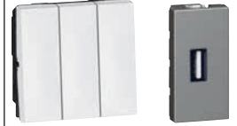
Arteor modules www.legrand.co.uk