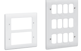
Complete range of grid front plates and modules p. 61-66