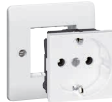
For German standard socket outlet use Cat. Nos. 7300 92 + 5711 18