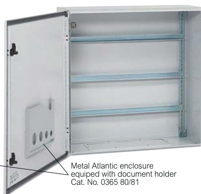
Metal Atlantic enclosure equipped with document holder Cat. No. 0365 80/81