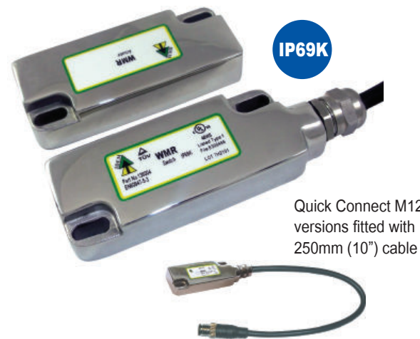
Quick Connect M12 versions fitted with 250mm (10") cable