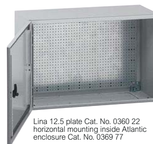
Lina 12.5 plate Cat. No. 0360 22 horizontal mounting inside Atlantic enclosure Cat. No. 0369 77

Enclosure and equipment selection chart p. 8-9 Technical characteristics p. 17