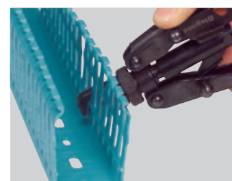
Tabs can be separated using pliers Cat.No 0 367 10

Technical characteristics p. 329 Approvals p. 906