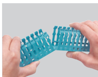
Manually separable trunking