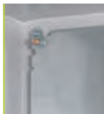
Removable plain mounting plate - provides maximum usable space and an easy method of fixing equipment directly. Optional perforated plates or ready to use chassis available