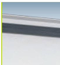
Weatherproof seal - polyurethane seal for greater reliability and total weatherproofing to IP 66