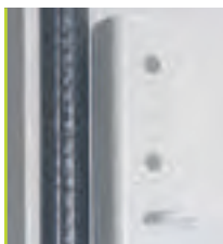
Sectioned uprights - provide greater door strength and mounting holes for cable trunking