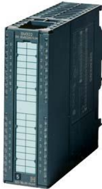
SIMATIC S7-300, Digital output SM 322, Isolated 16 DO, relay contacts, 1x 20-pole