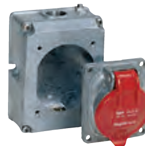
0522 33 + 0522 39

Technical information and dimensions p. 165-167 Conformity to International Standards p. 198