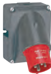
0521 73 + 0522 89