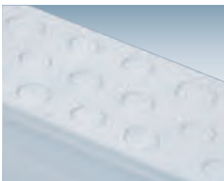
Knockout cable entries at the top and bottom of the enclosure