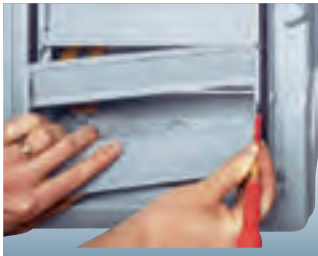
Removable faceplate: easier maintenance on individual rows