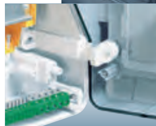
Hinged doors open fully for easy access to cables