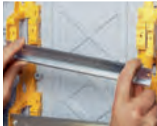
Rails can be removed one by one