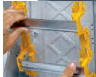
Removable chassis for wiring outside the enclosure