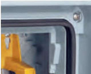
IP 65: weatherproofing and UV treatment guaranteed for applications in damp places