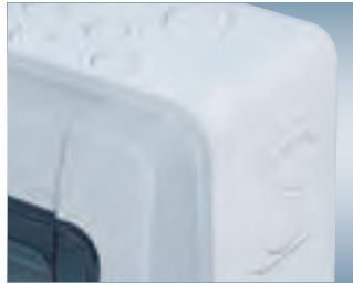
IK 09: enhanced impact resistance (shock-resistant polystyrene)