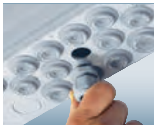
Cable glands can be fitted according to your requirements