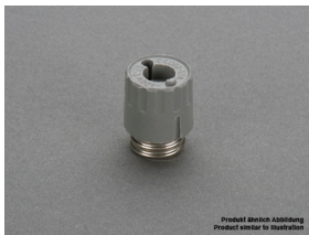
31006 D02 screw cap, plastic 400 V E 18