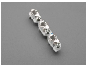
01647 CUSTO ® 60Classic D0-fuse base, busbar mounted, 27mm E 18 / 3P