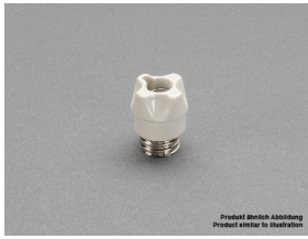
01104 D02 screw cap, porcelain 400 V E 18