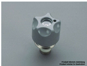
31104 D02 screw cap, plastic, with reducer for D01 400 V, with inspection hole E 18