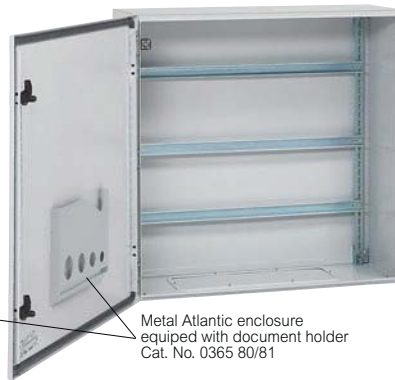
Metal Atlantic enclosure equipped with document holder Cat. No. 0365 80/81