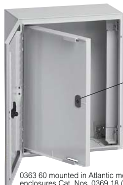
0363 60 mounted in Atlantic metal enclosures Cat. Nos. 0369 18 (p. 10) with Cat. No. 0363 69