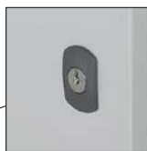
Accept key barrel

Enclosure and equipment selection chart p. 8-9 Technical characteristics p. 20