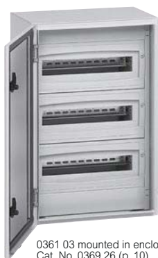
0361 03 mounted in enclosure Cat. No. 0369 26 (p. 10)

for Atlantic and Atlantic stainless steel enclosures