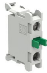
Contact elements, base mount on LPZ control station LPXCB