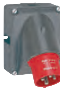
0521 73 + 0522 89