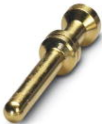
Turned 2.5 crimp contact, individual male contact, core diameter 2.5 mm 2 , gold-plated

Please be informed that the data shown in this PDF Document is generated from our Online Catalog. Please find the complete data in the user's documentation. Our General Terms of Use for Downloads are valid ( http://phoenixcontact.com/download )