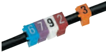
Perfect alignment of markers

for cables and Viking 3 terminal blocks (continued)