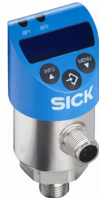
Product may differ from illustration