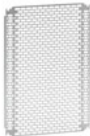
0 360 18