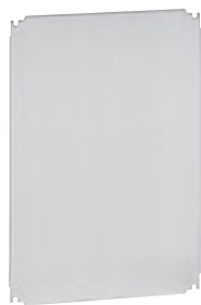
0 360 58