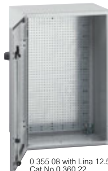
0 355 08 with Lina 12.5 plate Cat.No 0 360 22 vertical mounting