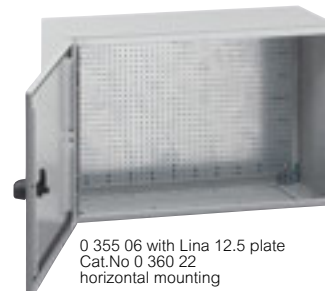
0 355 06 with Lina 12.5 plate Cat.No 0 360 22 horizontal mounting

Cabinet and equipment selection chart p. 262-263 Technical characteristics p. 277