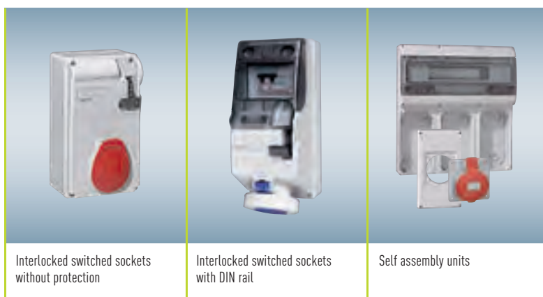
Interlocked switched sockets without protection

-20°C to +100°C without protection device -15°C to +40°C with protection device