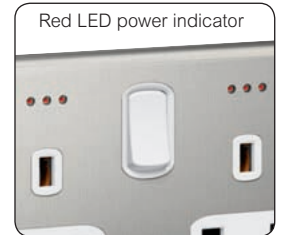
Red LED power indicator

Brushed stainless steel front plates : brushed stainless steel with clear epoxy satin lacquer coating Polished stainless steel front plates : electroplated stainless steel plate with trivalent chrome for mirror finish White interiors and rockers Terminal screws captive and backed off ready for cabling