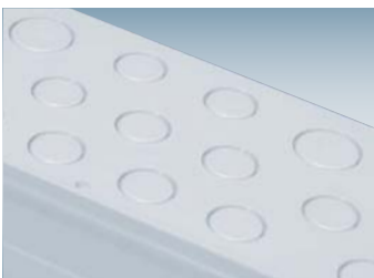
Knockout cable entries at the top and bottom of the enclosure