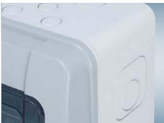
IK 09: enhanced impact resistance (shock-resistant polystyrene)