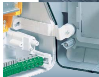
Hinged doors open fully for easy access to cables