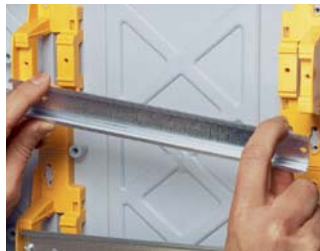
Rails can be removed one by one