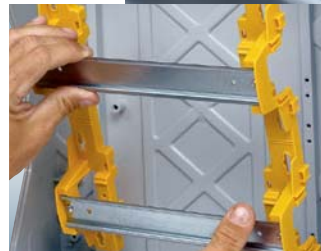
Removable chassis for wiring outside the enclosure