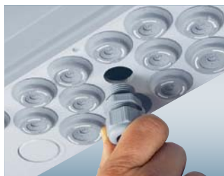
Cable glands can be fitted according to your requirements