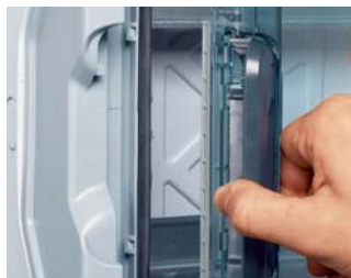
Double closing point to ensure a good seal