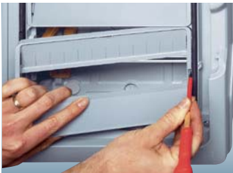
Removable faceplate: easier maintenance on individual rows