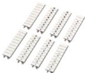
Zack marker strip, 10-section, vertically labeled with the consecutive numbers: 11 ... 20, white, width: 5 mm

Please be informed that the data shown in this PDF Document is generated from our Online Catalog. Please find the complete data in the user's documentation. Our General Terms of Use for Downloads are valid ( http://phoenixcontact.com/download )