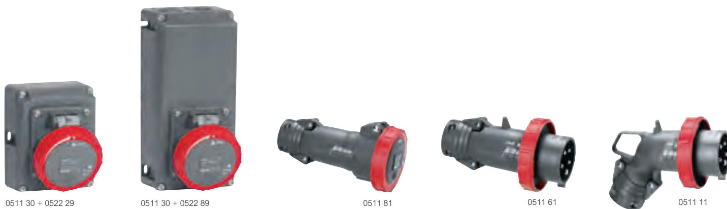
0511 30 + 0522 29