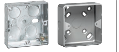
Flush and surface mounting back boxes p. 187