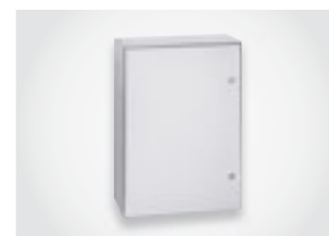
▶▶▶ Atlantic stainless steel cabinets