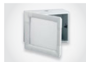
▶▶▶ Atlantic Axis control consoles