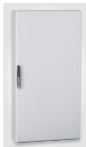
▶▶▶ Altis enclosures