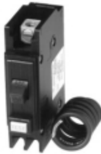
QUICKLAG Type QCGF 1-Pole Ground Fault Circuit Breaker