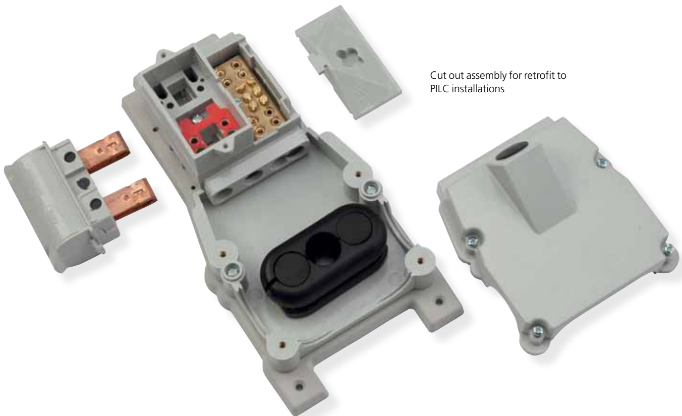
Cut out assembly for retrofit to PILC installations