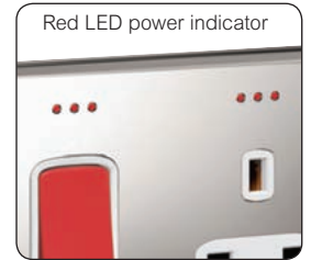
Red LED power indicator

Brushed stainless steel front plates : brushed stainless steel with clear epoxy satin lacquer coating Polished stainless steel front plates : electroplated stainless steel plate with trivalent chrome for mirror finish White interiors and rockers (red rockers for specific items) Terminal screws captive and backed off ready for cabling